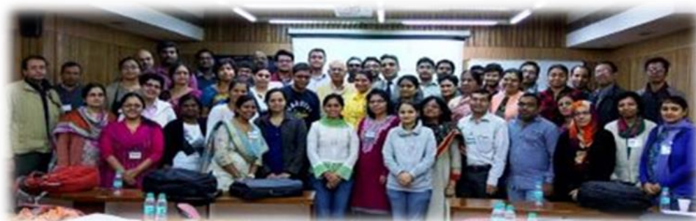
Essentials of Statistics and Clinical Data Analysis using R" from Dec 1 – 4, 2015

Department of Biostatistics at CDSA, has been continuously putting effort conducting training programs (awareness as well as hands-on) in addition to provide statistical services to investigators. Three training programs have been conducted in last year. Recently hands-on training program has been organized on "Essentials of Statistics and Clinical Data Analysis using R" from Dec 1 – 4, 2015 was held at ICGEB, Delhi where 45 participants took part from various part of the country including one international participant from ICDDR,B (International Center for Diarrheal Disease Research, Bangladesh).