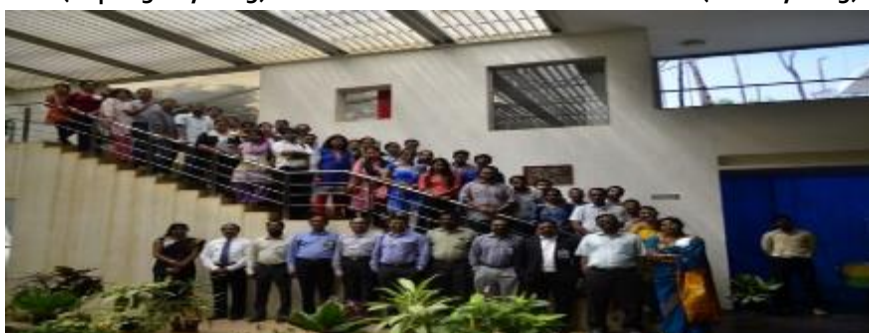
Regulatory Requirements & Clinical Development – A Workshop to Unlock the Potential of your Innovation’ (Oct 16, 2015) at C-CAMP, Bangalore