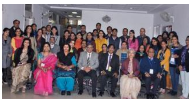
Current Ethical & Regulatory Requirements (An Awareness Program) for Clinical Trials at ESIC Dental College, Rohini (Dec 15, 2015)