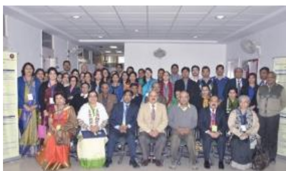
Good Clinical Practice (GCP) (An Awareness Program) at ESIC Dental College, Rohini (Dec 14, 2015)