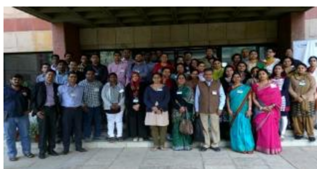
Essentials of Statistics and Clinical Data Analysis using R at ICGEB, New Delhi (Dec 01-04, 2015)