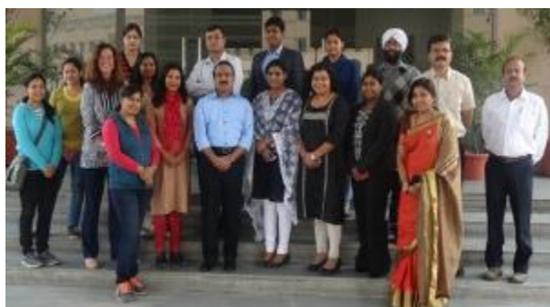
Presentation & Communication Skills Training for Scientists and Program Staff at THSTI, Faridabad (Nov 30, 2015)