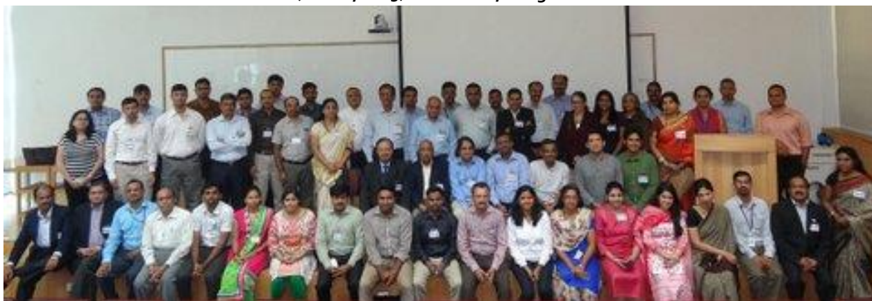
BIRAC-CDSA Workshop Series in South India: "Regulatory Requirements for Biopharmaceuticals – From Science to Commercialization" at NCBS, Bangalore (Oct 15, 2015)

"Its really a nice opportunity and a very much useful Friday spent at C-CAMP during the workshop. It is to be really appreciated with respect to the arrangements and the opportunity not alone to meet the regulators but also the different entrepreneurs and their different ideas. Thanks for the opportunity and looking forward to much more interaction and help in future. Can we contact you in future for any assistance?"