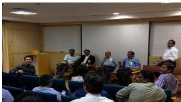
Meet the Regulators @ C-CAMP, Bangalore (Oct 16, 2015)